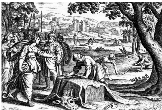
Dido founds Carthage

In this course, we will examine this problem from its foundations, tracing ancient solutions to the problem and the underlying mathematical challenges: