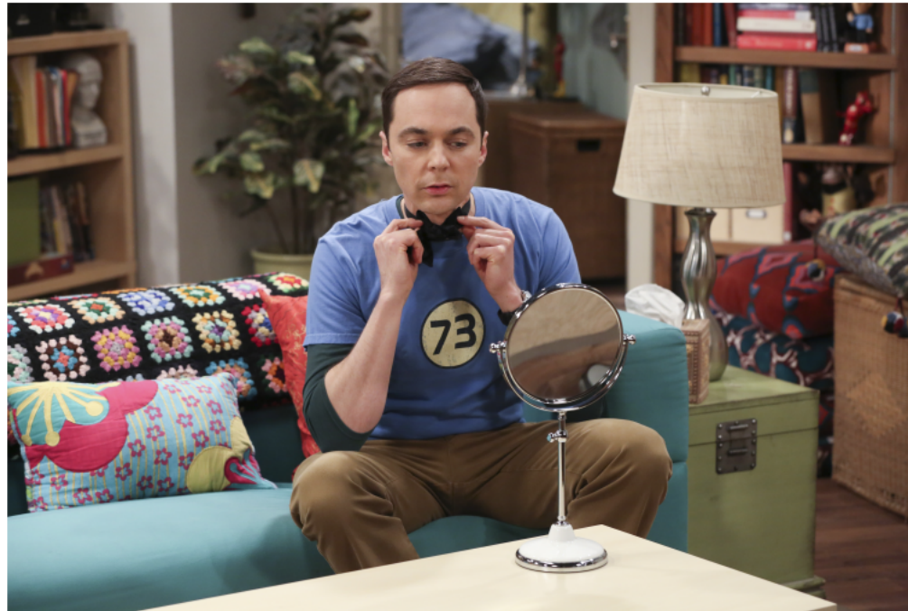
Figure 1. Sheldon always knew 73 was the best.