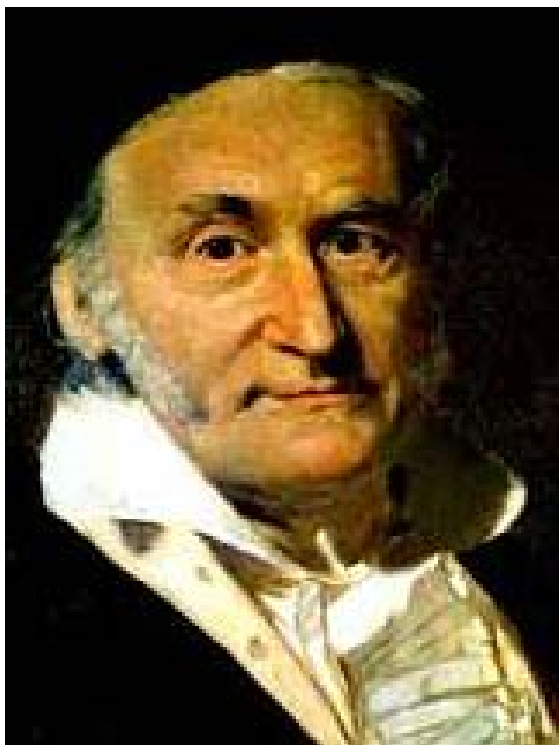
Carl Friedrich Gauss