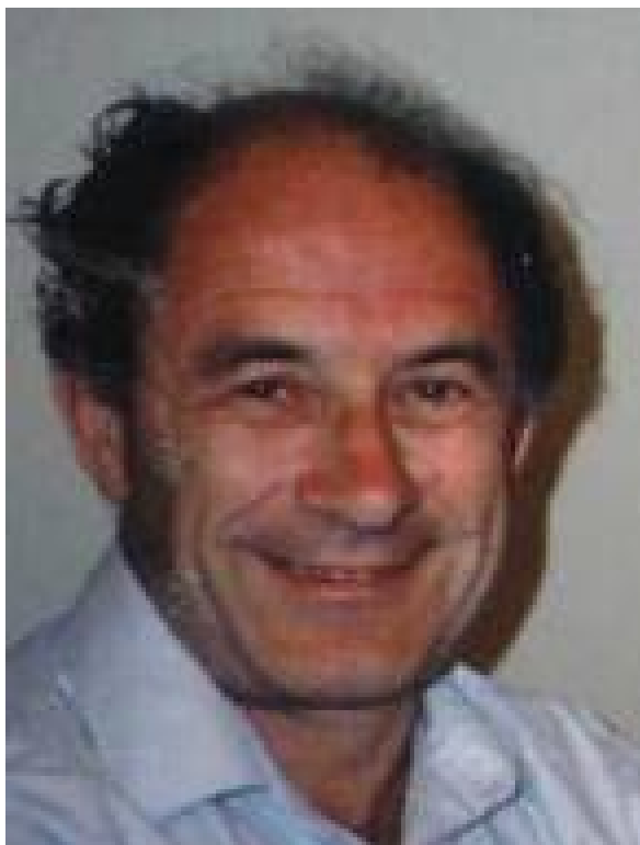
Vladimir I. Arnold