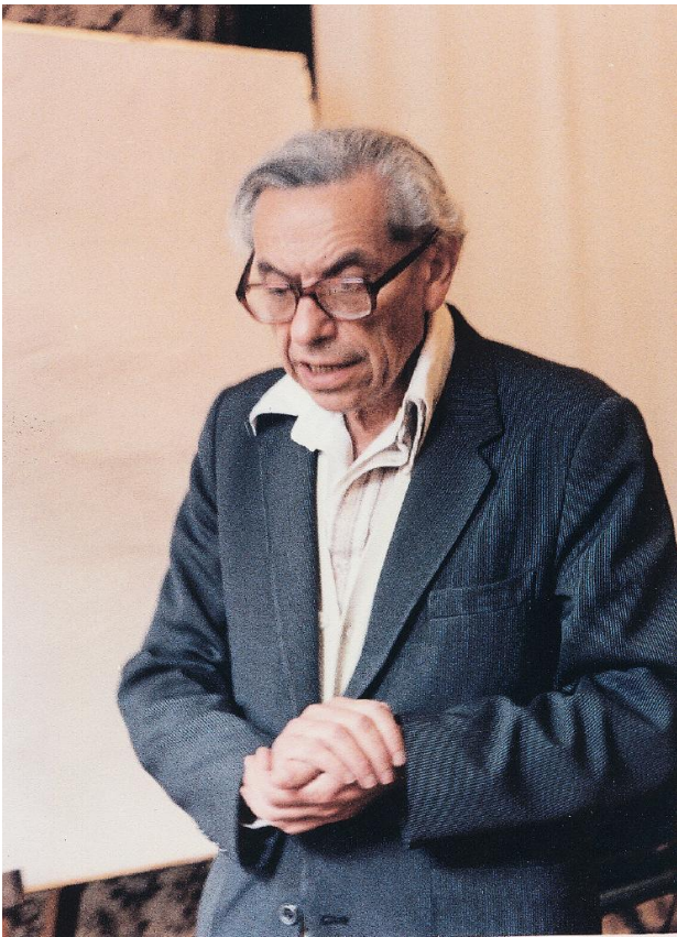
Paul Erdős , 1913–1996

Paul Erdős studied this problem in two papers, one in 1955, the other in 1960.