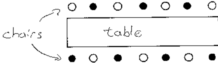
Figure 2: Real-world ménage problem.

it not for this tradition, it would not have taken half a century to discover Touchard's formula for M_n . Of all the ways in which sexism has held back the advance of mathematics, this may well be the most peculiar. (But see Exercise 2.)